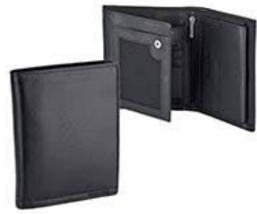
Wallet 11 credit card slots 4 document pockets 2 note compartments 2 zipper pockets coin pocket ◆ 169 129 12x11,5 cm