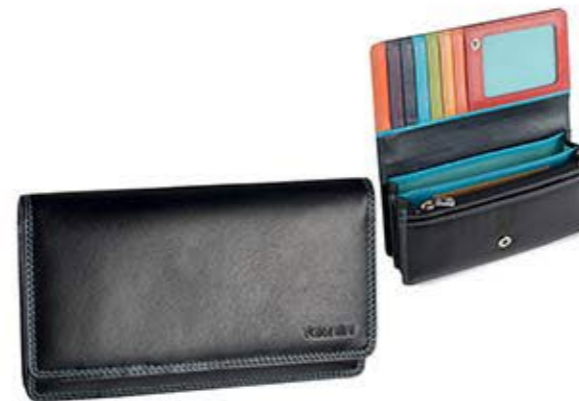
Ladies purse 11 credit card slots 5 document pockets zipper pocket coin pocket ◆ 123 550 16,5x20 cm