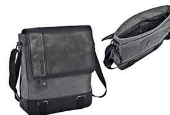
Shoulder bag 1 compartment 1 pocket 2 zipper pockets organizer adjustable strap max 135 cm