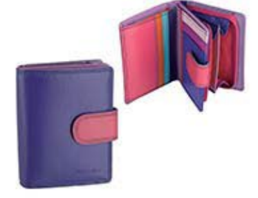
Ladies purse 7 credit card slots 7 document pockets note compartment coin pocket ◆ 123 548 11,5x9 cm