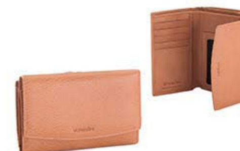
Ladies purse 11 credit card slots 5 document pockets note compartment coin pocket