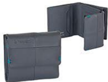
Ladies purse 4 credit card slots 4 document pockets coin pocket ◆ 166 108 10x9 cm