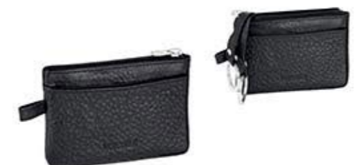
Key case document pocket 2 key rings ◆ 159 328 11x7,5 cm