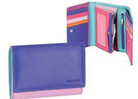
Ladies purse 11 credit card slots 7 document pockets zipper pocket coin pocket ◆ 123 681 14x10 cm