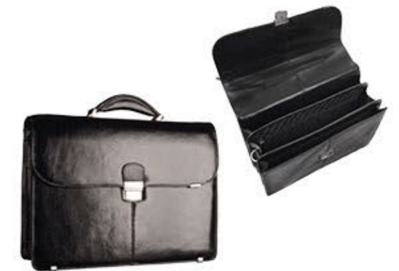
Briefcase 2 compartments 1 zipper compartment 3 zipper pockets organizer