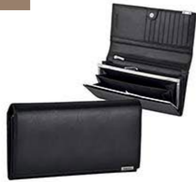
Ladies purse 10 credit card slots 4 document pockets 3 note compartments zipper pocket coin pocket ◆ 161N 273 19x9,5 cm