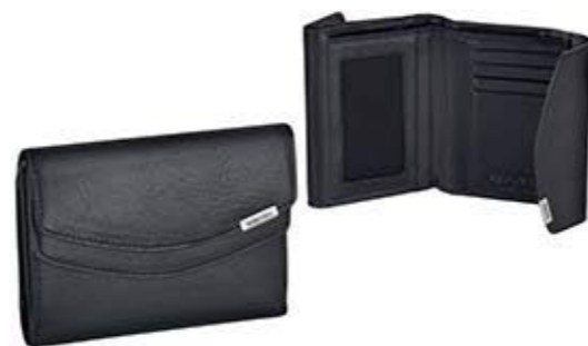
Ladies purse 4 credit card slots 4 document pockets 2 note compartments coin pocket ◆ 161N 504 12,5x9,5 cm