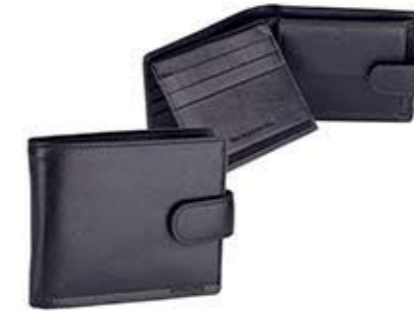
Wallet 7 credit card slots 3 document pockets note compartment coin pocket ◆ 169 902 10x9 cm