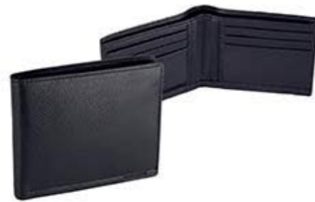
Wallet 6 credit card slots 4 document pockets note compartment ◆ 169 320 11,5x9 cm