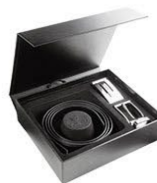
Belt sizes: 105-130 cm width: 3,0 cm colour: black, t. moro