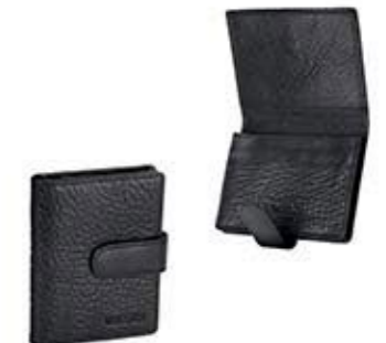
Name card holder name card pocket 3 document pockets ◆ 159 013 10,5x7,5 cm