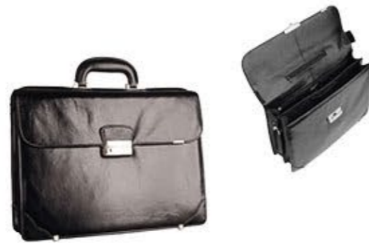
Briefcase 2 compartments 3 zipper pockets organizer