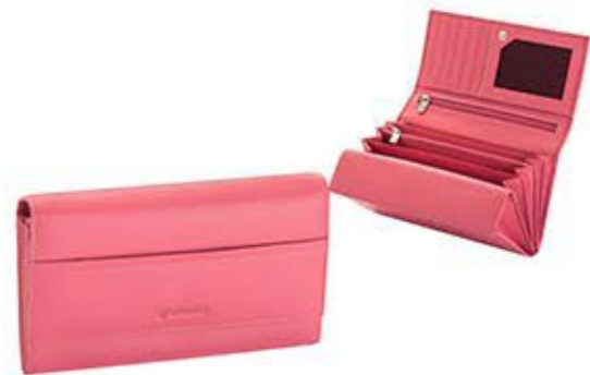
Ladies purse 9 credit card slots 3 document pockets 4 note compartments 2 zipper pockets coin pocket ◆ 154 262 17x10 cm