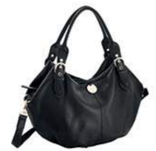
Handbags 1 compartment inside pocket outside zipper pocket organizer adjustable strap max 120 cm ◆ 954 422 41x26x15 cm