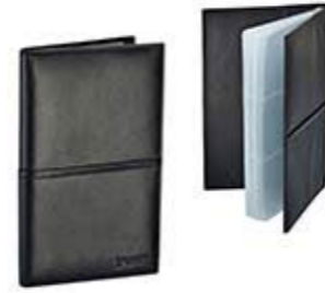
Name card holder 2 document pockets 60 name card slots ◆ 154 677 11,5x19 cm