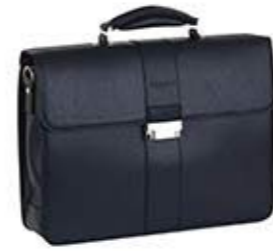
Briefcase 2 compartments 1 zipper compartment 2 zipper pockets organizer adjustable strap max 125cm ◆ 557 105 36x27x9 cm