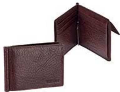
Wallet 6 credit card slots 2 document pockets coin pocket ◆ 159 260 11,5x8 cm