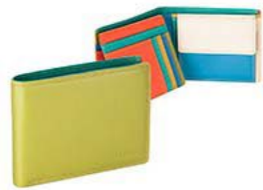
Wallet 8 credit card slots 4 document pockets coin pocket ◆ 123 290 13x9,5 cm