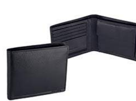
Wallet 5 credit card slots 2 document pockets note compartment coin pocket