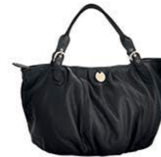
Handbags 2 compartments 2 inside zipper pockets organizer ◆ 954 416 50x29x13 cm