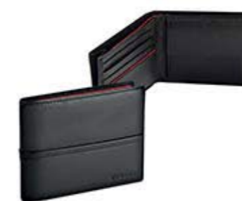
Wallet 4 credit card slots 2 document pockets 2 note compartments coin pocket ◆ 154 274 11x9 cm