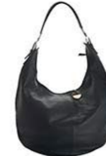
Handbags 1 compartment inside pocket outside zipper pocket inside zipper pocket ◆ 954 417 40x28x18 cm