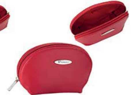
Pouch ◆ 123 798 17x7 cm