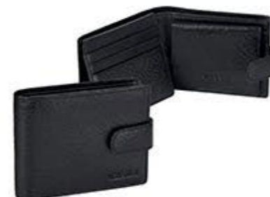
Wallet 6 credit card slots 4 document pockets 2 note compartments coin pocket ◆ 159 902 10,5x9 cm