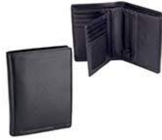
Wallet 7 credit card slots 6 document pockets note compartment coin pocket ◆ 169 265 12,5x9,5 cm