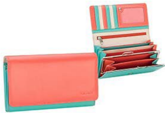
Ladies purse 6 credit card slots 5 document pockets 3 note compartments zipper pocket coin pocket ◆ 123 273 17,5x10 cm