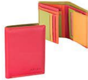
Wallet 8 credit card slots 6 document pockets 2 note compartments coin pocket ◆ 123 266 9,5x12 cm