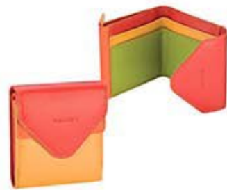
Ladies purse 2 note compartments coin pocket ◆ 123 417 9x9,5 cm