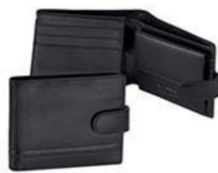
Wallet 4 document pockets 6 credit card slots 2 note compartments coin pocket ◆ 152 902 10,5x9 cm