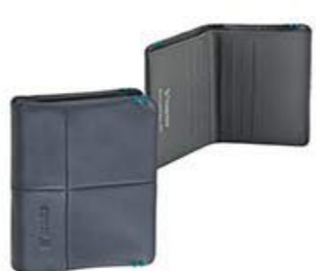
Business card holder 6 credit card slots 2 document pockets ◆ 166 303 10x8,5 cm