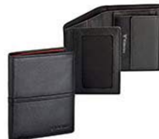
Wallet 4 credit card slots 5 document pockets coin pocket ◆ 154 115 11x9 cm