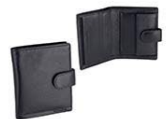
Wallet 4 credit card slots 3 document pockets note compartment coin pocket