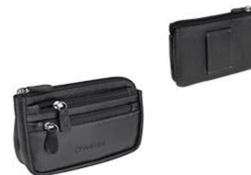
Sachet 2 zipper pockets belt assembling