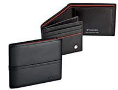
Wallet 9 credit card slots 4 document pockets 2 note compartments coin pockets ◆ 154 267 12,5x10 cm