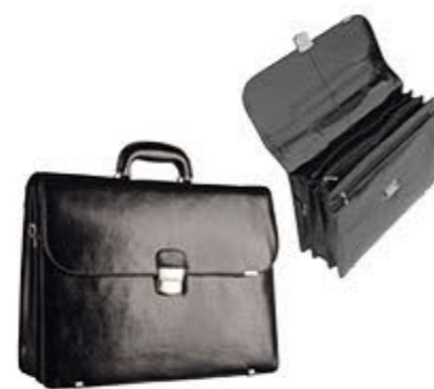
Briefcase 3 compartments 1 pocket 5 zipper pockets organizer