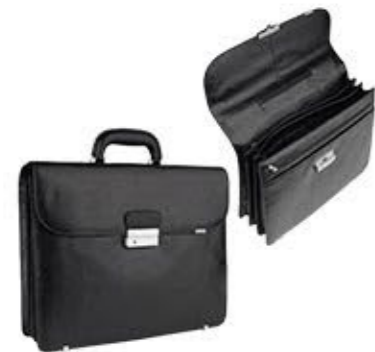
Briefcase 3 compartments 1 pocket 4 zipper pockets organizer