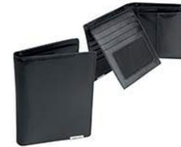
Wallet 10 credit card slots 3 document pockets coin pocket ◆ 161N 911 12,5x10,5 cm