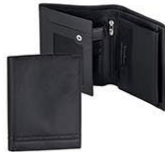
Wallet 4 document pockets 10 credit card slots 2 note compartments coin pocket ◆ 152 665 11x13 cm