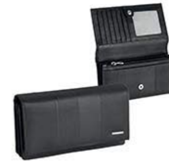
Ladies purse 12 credit card slots 4 document pockets 2 note compartments coin pocket