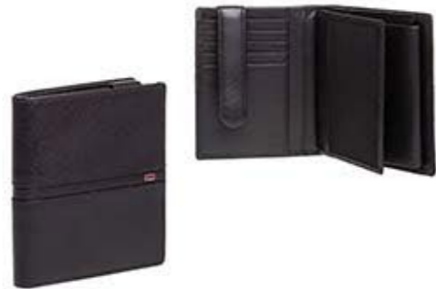
Wallet 11 CC slots 7 document pockets 2 note compartments coin pocket ◆ 158 275 11x12,5 cm