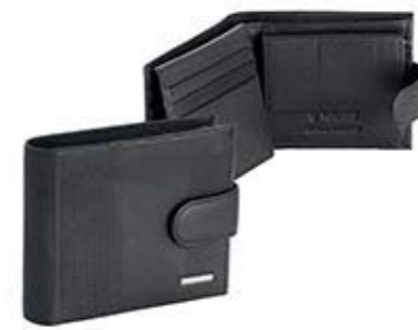
Wallet 10 credit card slots 2 document pockets 2 note compartments coin pockets ◆ 157 902 11x9 cm