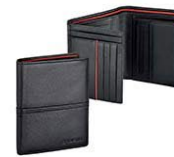
Wallet 7 credit card slots 6 document pockets 2 note compartments coin pocket ◆ 154 266 12,5x9,5 cm