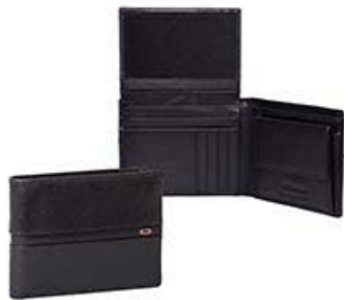
Wallet 8 CC slots 8 document pockets 2 note compartments hidden note compartment coin pocket ◆ 158 290 12,5x9,5 cm