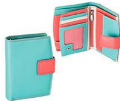
Ladies purse 6 credit card slots 5 document pockets zipper pocket coin pocket ◆ 123 297 12,5x10 cm