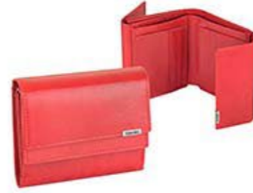
Ladies purse 6 credit card slots 6 document pockets 2 note compartments zipper pocket coin pocket ◆ 161N 503 11,5x10 cm