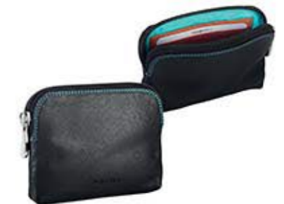
Pouch 3 document pockets ◆ 123 686 12,5x9 cm