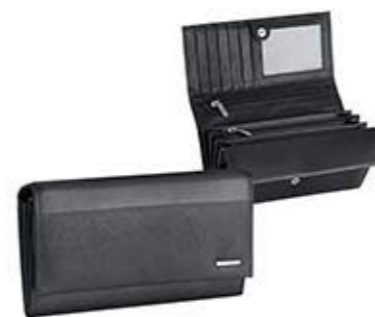
Ladies purse 9 credit card slots 5 document pockets 4 note compartments coin pocket