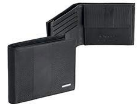
Wallet 4 credit card slots 2 document pockets 2 note compartments coin pocket