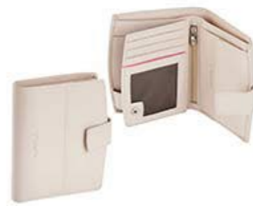
Ladies purse 6 credit card slots 5 document pockets zipper pocket coin pocket ◆ 154 297 12,5x10 cm