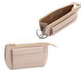
Key case coin pocket 2 key rings ◆ 154 326 11,5x6 cm