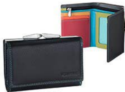
Ladies purse 3 credit card slots 3 document pockets 2 note compartments coin pocket ◆ 123 386 12,5x9 cm