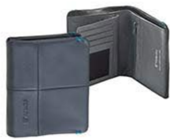
Wallet 8 credit card slots 7 document pockets 2 note compartments zipper pocket coin pocket ◆ 166 265 12x10 cm