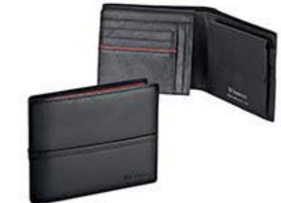
Wallet 9 credit card slots 7 document pockets 2 note compartments coin pocket ◆ 154 502 12,5x10 cm