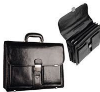
Briefcase 3 compartments 2 zipper compartments 3 pockets 4 zipper pockets organizer