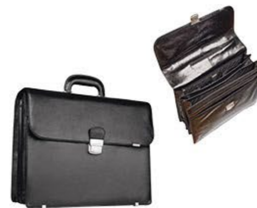
Briefcase 2 compartments 1 zipper compartment 2 zipper pockets