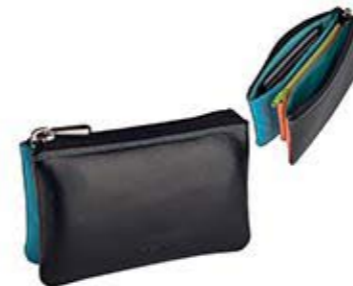
Ladies purse 6 credit card slots zipper pocket ◆ 123 505 14,5x9 cm