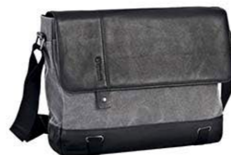
Shoulder bag 1 compartment laptop holder 15" 1 pocket 2 zipper pockets organizer adjustable strap max 130 cm