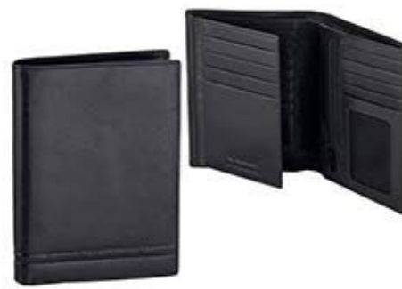
Wallet 5 document pockets 17 credit card slots 1 note compartment coin pocket ◆ 152 118 11x15 cm