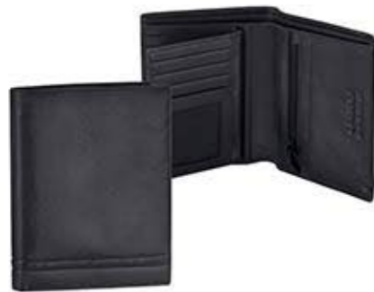
Wallet 7 document pockets 8 credit card slots 2 note compartments coin pocket ◆ 152 265 10x12,5 cm