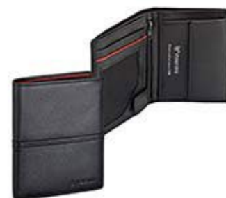
Wallet 5 credit card slots 3 document pockets 1 note compartment zipper pocket coin pocket ◆ 154 213 9x10,5 cm