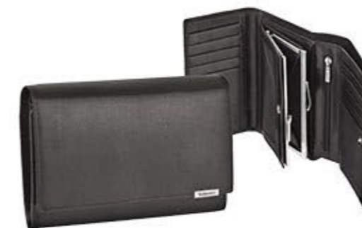
Ladies purse 11 credit card slots 5 document pockets zipper pocket coin pocket