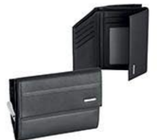
Ladies purse 6 credit card slots 5 document pockets note compartment coin pocket