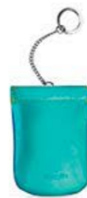
Key case ◆ 123 449 11x8 cm