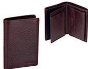
Wallet 4 credit card slots 5 document pockets 2 note compartments coin pocket ◆ 159 469 13x9 cm