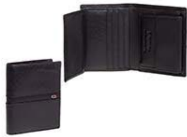
Ladies purse 4 CC slots 4 document pockets 1 note compartment coin pocket ◆ 158 115 9x11 cm