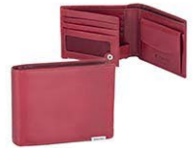
Wallet 7 credit card slots 4 document pockets 2 note compartments coin pocket ◆ 161N P20 12,5x9,5 cm