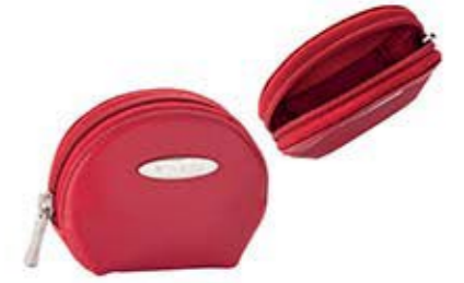
Pouch ◆ 123 795 10x4,5 cm