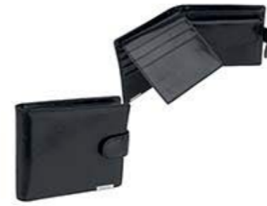
Wallet 7 credit card slots 4 document pockets 2 note compartments coin pocket ◆ 161N 902 10,5x9 cm