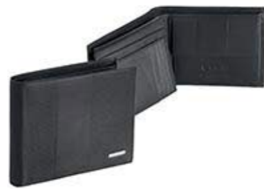
Wallet 8 credit card slots 7 document pockets 2 note compartments coin pocket ◆ 157 290 12,5x9,5 cm