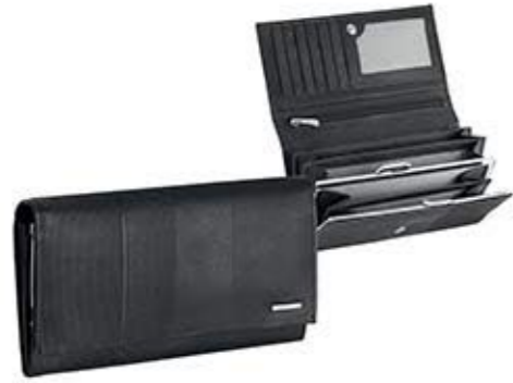
Ladies purse 7 credit card slots 5 document pockets 3 note compartments coin pocket ◆ 157 273 17,5x10,5 cm