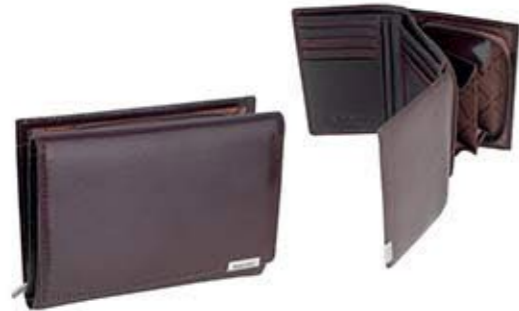
Ladies purse 10 credit card slots 6 document pockets coin pocket ◆ 161N 0P6 13x9 cm