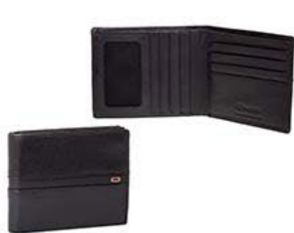
Wallet 8 CC slots 2 document pockets 2 note compartments ◆ 158 322 12x10 cm