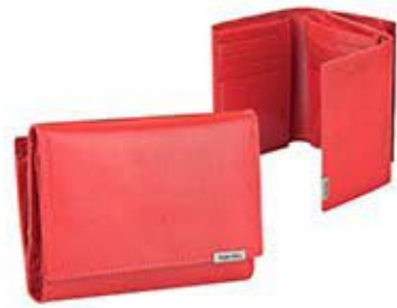
Ladies purse 8 credit card slots 4 document pockets 2 note compartments zipper pocket coin pocket ◆ 161N 263 12x9 cm