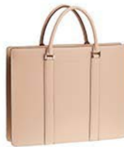
Briefcase 1 compartment 1 zipper pocket laptop pocket width 35cm organizer adjustable strap max 130cm ◆ 557 107 40x31x7 cm