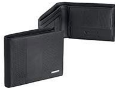
Wallet 4 credit card slots 4 document pockets 2 note compartments coin pocket ◆ 157 274 12x9,5 cm