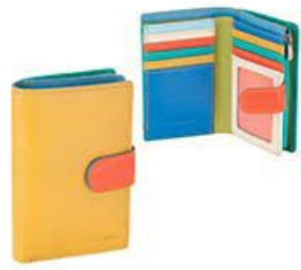
13 credit card slots 3 document pockets note compartment coin pocket ◆ 123 042 14x9 cm