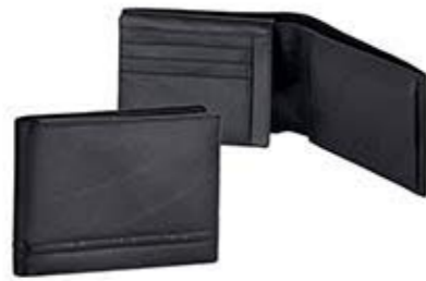
Wallet 6 document pockets 7 credit card slots 2 note compartments coin pocket ◆ 152 290 12,5x9 cm