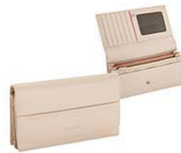
Ladies purse 7 credit card slots 3 document pockets 2 note compartments coin pocket zipper pocket ◆ 154 550 16,5x10 cm