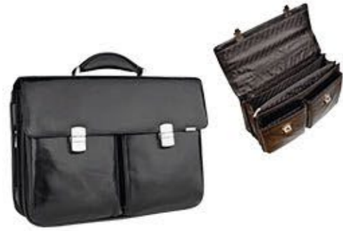
Briefcase 3 compartments 1 zipper compartment 2 pockets 2 zipper pockets organizer