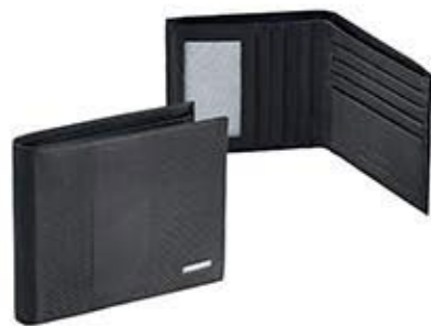
Wallet 8 credit card slots 2 document pockets 2 note compartments ◆ 157 322 12x10 cm