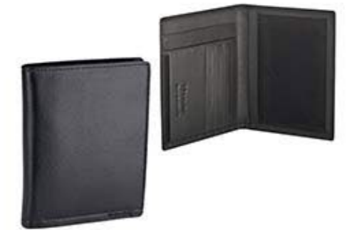
Document holder 4 credit card slots 4 document pockets