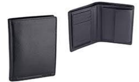
Wallet 4 credit card slots 5 document pockets coin pocket ◆ 169 784 12,5x10 cm