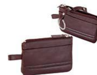
Key case 1 document pocket 2 key rings ◆ 152 328 11,5x7,5 cm