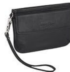
Sachet 1 pocket