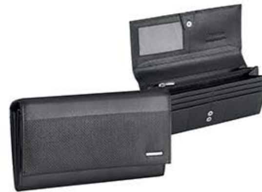
Ladies purse 18 credit card slots 5 document pockets zipper pocket coin pocket