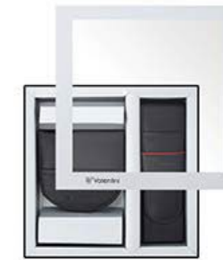
Gift set ◆ 154 103 Ladies purse 154-418 (9,5x9,5 cm) 2 document pockets 2 note compartments coin pocket Pen holder 154-436 (5x17 cm) 2 pen loops