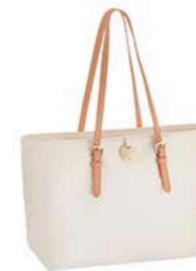
Handbags 1 compartment inside zipper pocket ◆ 954 508 42x24x13 cm