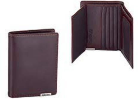
Business card holder 8 credit card slots 2 document pockets note compartment ◆ 161N 316 10,5x8 cm