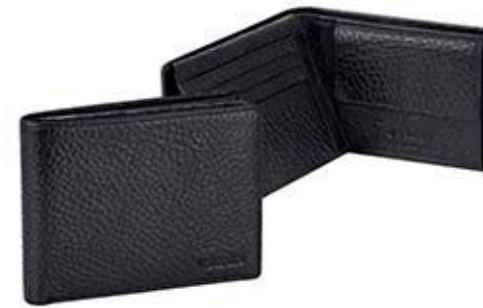
Wallet 8 credit card slots 5 document pockets 2 note compartments coin pocket ◆ 159 290 13x9,5 cm