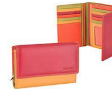
Ladies purse 11 credit card slots 8 document pockets note compartment coin pocket ◆ 123 P62 14,5x9,5 cm