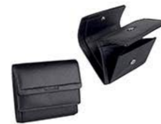
Wallet coin pocket note component