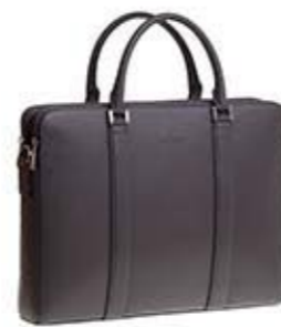
Briefcase 3 compartments 1 zipper pocket laptop pocket width 38cm organizer adjustable strap max 135cm ◆ 557 108 40x30x8 cm