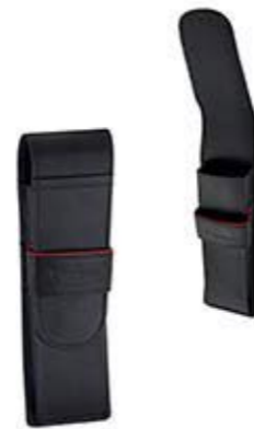
Pen case pen loop ◆ 154 435 4x17,5 cm