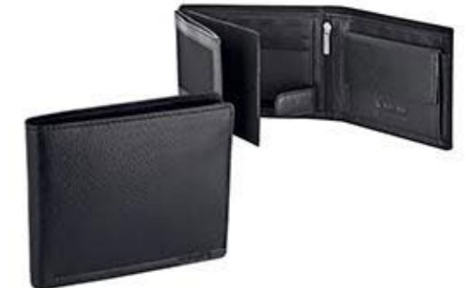
Wallet 7 credit card slots 4 document pockets 2 note compartments coin pocket ◆ 169 P20 12,5x9,5 cm