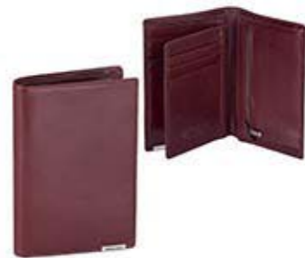
Wallet 7 credit card slots 5 document pockets 2 note compartments coin pocket ◆ 161N 117 13x9 cm