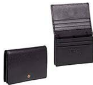
Wallet 5 CC slots name card pocket document pocket hidden magnet closing coin pocket ◆ 158 013 10,5x8 cm