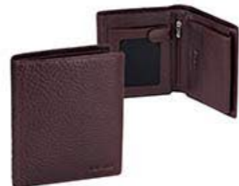
Wallet 10 credit card slots 5 document pockets 2 note compartments zipper pocket coin pocket ◆ 159 665 13x11 cm