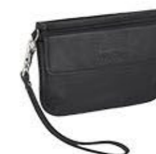
Sachet 1 pocket