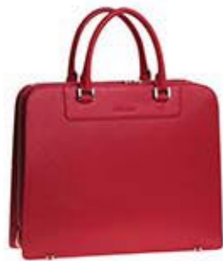
Briefcase 3 compartments 1 pocket 1 zipper pocket organizer adjustable strap max 135cm ◆ 557 106 38x31x10 cm