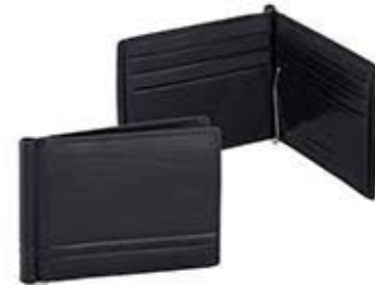
Wallet 2 document pockets 6 credit card slots coin pocket ◆ 152 260 11,5x8,5 cm