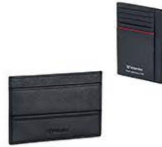
Document holder 4 credit card slots 3 document pockets ◆ 154 321 8,5x12,5 cm