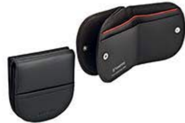
Ladies purse 2 document pockets 2 note compartments coin pocket ◆ 154 418 9,5x9,5 cm