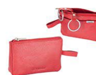
Key case document pocket ◆ 161N 328 11x7,5 cm