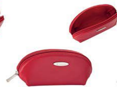
Pouch ◆ 123 797 15x6 cm