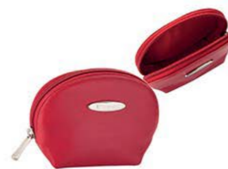
Pouch ◆ 123 796 13,5x6 cm