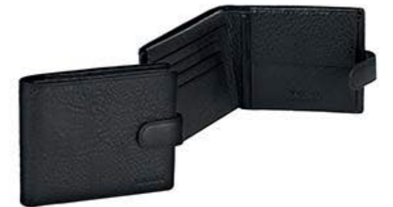
Wallet 10 credit card slots 5 document pockets 2 note compartments coin pocket ◆ 159 293 13x10 cm