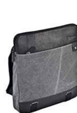
Shoulder bag 1 compartment 3 zipper pockets organizer adjustable strap max 150 cm