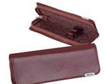
Pen case ◆ 161N 345 16x5 cm