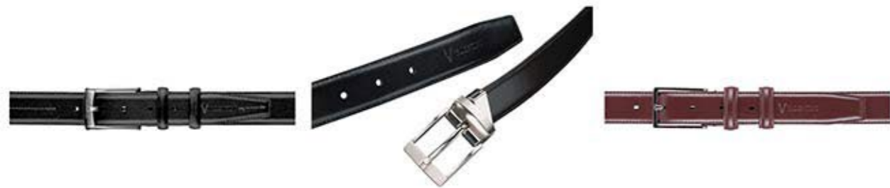
Belt sizes: 105-130 cm width: 3,5 cm colour: black, t. moro ◆ 256 303