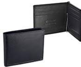
Wallet 6 credit card slots 2 document pockets ◆ 169 260 11,5x8 cm