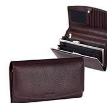
Ladies purse 9 credit card slots 5 document pockets 3 note compartments zipper pocket coin pocket