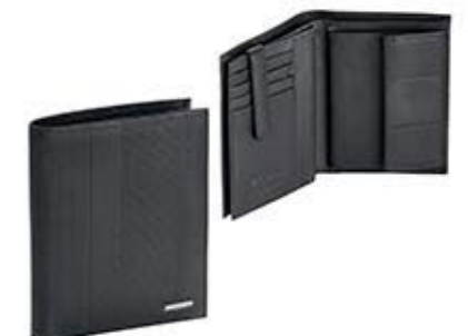
Wallet 8 credit card slots 9 document pockets 2 note compartments coin pocket ◆ 157 275P 10x12,5 cm