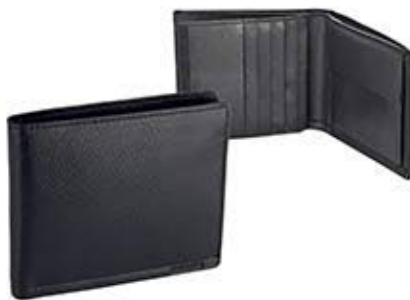
Wallet 10 credit card slots 3 document pockets 2 note compartments coin pocket ◆ 169 292 12,5x10 cm