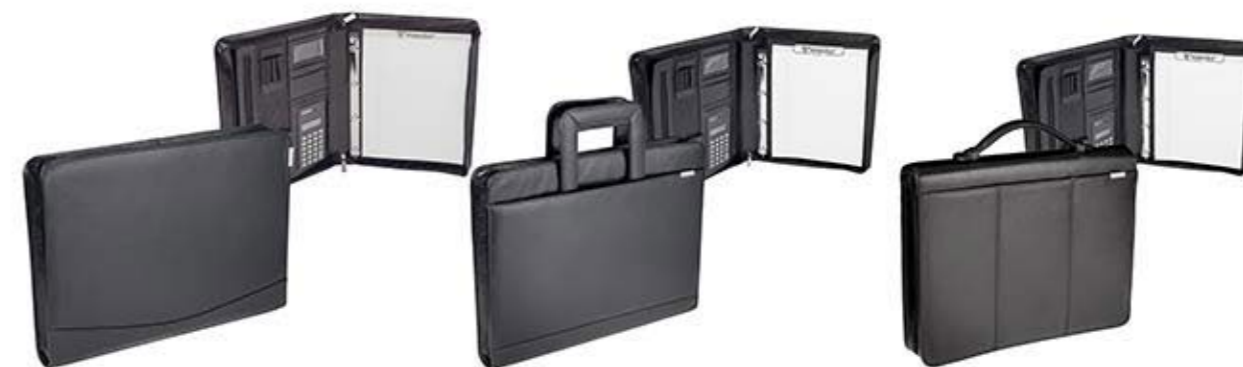
Conference briefcase 1 compartment organizer key ring note clip