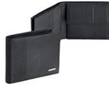
Wallet 10 credit card slots 3 document pockets 2 note compartments coin pocket ◆ 157 292 12x10 cm