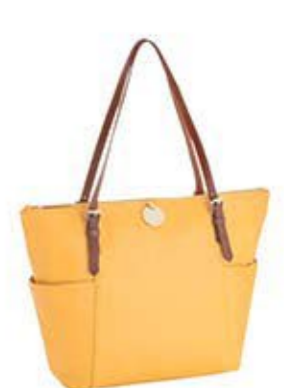
Handbags 1 compartment zipper pocket 4 pockets 2 outside pockets ◆ 954 509 40x28x11 cm