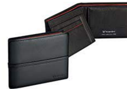
Wallet 4 credit card slots 7 document slots 2 note compartments coin pocket ◆ 154 268 12,5x9,5 cm