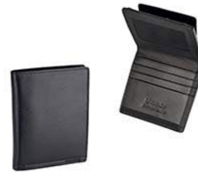
Wallet 6 credit card slots 2 note compartments coin pocket ◆ 169 415 9,5x10 cm