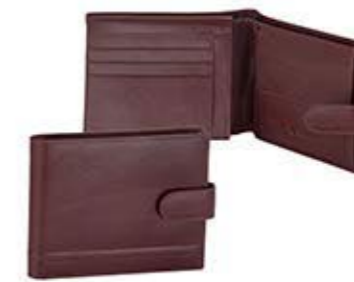
Wallet 5 document pockets 10 credit card slots 2 note compartments coin pocket ◆ 152 293 13x10,5 cm