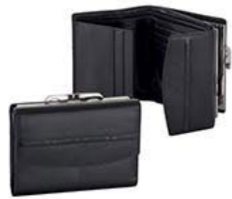
Ladies purse 6 document pockets 6 credit card slots 2 note compartments coin pocket ◆ 152 455 9,5x10 cm