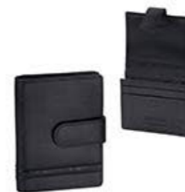
Name card holder name card pocket 2 document pockets ◆ 152 013 10,5x7,5 cm