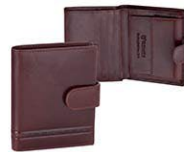
Wallet 2 document pockets 3 credit card slots 1 note compartment coin pocket ◆ 152 116 8,5x10,5 cm