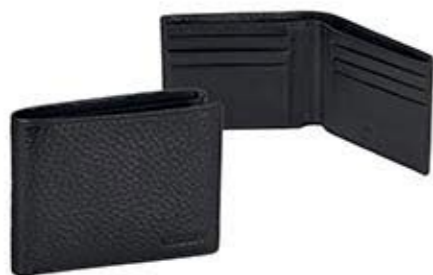
Wallet 6 credit card slots 4 document pockets 2 note compartments ◆ 159 320 11,5x9 cm