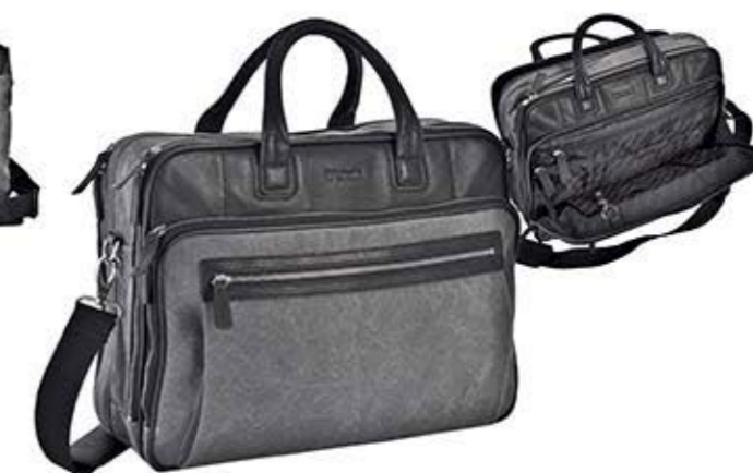
Shoulder bag 2 compartments laptop pocket 15" 8 pockets 4 zipper pockets organizer adjustable strap max 165 cm