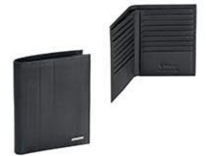
Credit card holder 16 credit card slots 2 document pockets note compartment ◆ 157 P63 11x14 cm