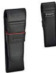
Pen case 2 pen loops ◆ 154 436 5x17 cm