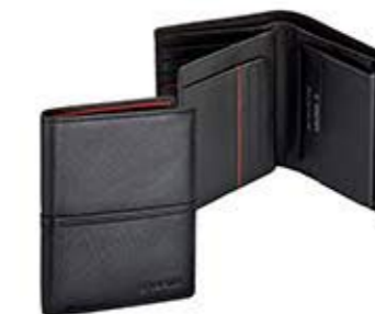
Wallet 7 credit card slots 7 document pockets 2 note compartments coin pocket ◆ 254 467 12,5x9,5 cm