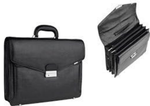
Briefcase 3 compartments 5 zipper pockets 1 pocket organizer