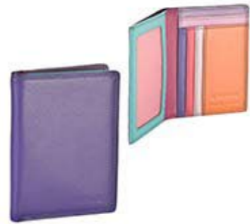
Document holder 3 credit card slots 4 document pockets note compartment ◆ 123 010 9x12 cm