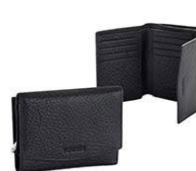
Ladies purse 8 credit card slots 4 document pockets coin pocket