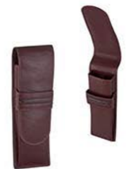
Pen case 2 pen loops ◆ 152 436 5,5x17 cm