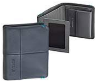
Wallet 4 credit card slots 4 document pockets zipper pocket coin pocket ◆ 166 115 10x8,5 cm