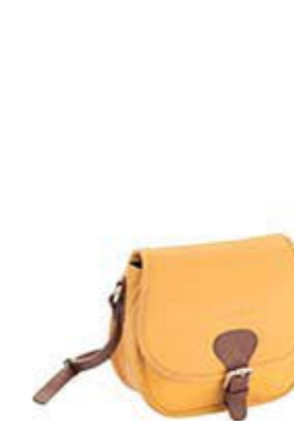
Handbags 1 compartment outside zipper pocket 2 inside pockets inside zipper pocket ◆ 954 503 20x18x7 cm