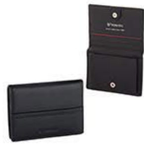
Name card holder 3 document pockets name card pocket ◆ 154 349 10,5x7,5 cm