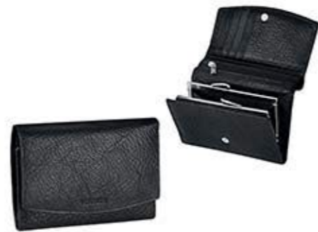
Ladies purse 10 credit card slots 8 document pockets note compartment coin pocket ◆ 159 681 14x10,5 cm