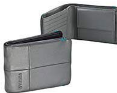
Wallet 4 credit card slots 3 document pockets 2 note compartments zipper pocket coin pocket ◆ 166 274 11,5x8,5 cm