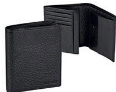
Wallet 4 credit card slots 4 document pockets note compartment coin pocket ◆ 159 459 12,5x10,5 cm