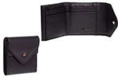
Ladies purse coin pocket 2 note compartments inside pocket ◆ 158 417 9x9 cm