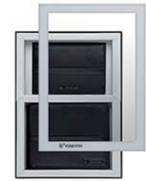
Gift set ◆ 154 102 Wallet 154-268 (12,5x9,5 cm) 4 credit card slots 7 document pockets 2 note compartments coin pocket Name card holder 154-349 (10,5x7,5 cm) 2 document pockets name card pocket