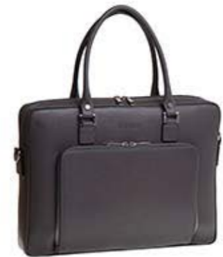
Briefcase 6 document pockets 7 credit card slots 2 note compartments coin pocket