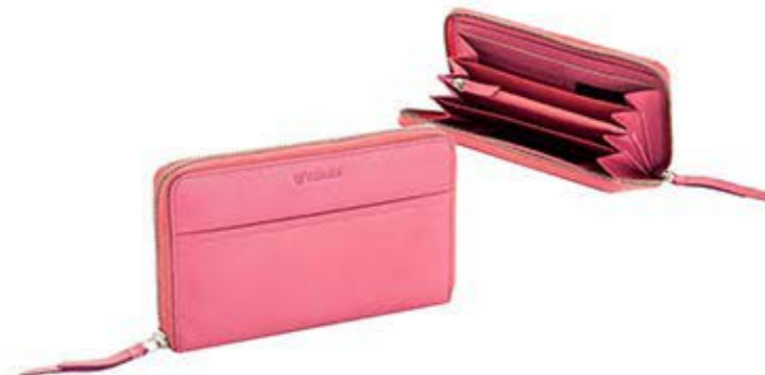
Ladies purse 4 credit card slots 4 document pockets 4 note compartments coin pocket ◆ 154 820 17,5x11 cm