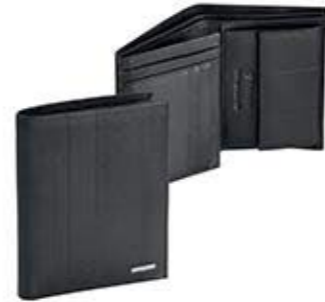
Wallet 8 credit card slots 6 document pockets 2 note compartments coin pocket ◆ 157 266 10x12,5 cm