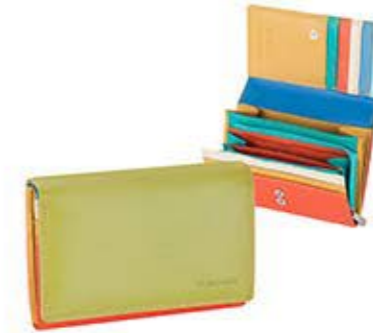
Ladies purse 5 credit card slots 9 document pockets note compartment coin pocket ◆ 123 531 13,5x9,5 cm