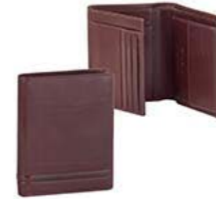
Wallet 5 document pockets 10 credit card slots 2 note compartments coin pocket ◆ 152 098 9,5x10 cm