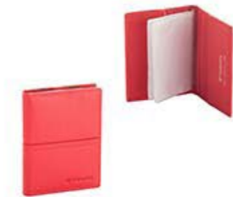
Document holder 6 document pockets 8 name card slots ◆ 154 667 8x10,5 cm