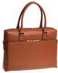
Briefcase 1 compartment 3 zipper pockets adjustable strap max 135cm ◆ 557 103 35,5x28x9 cm