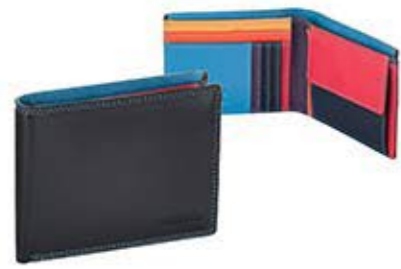
Wallet 4 credit card slots 3 document pockets 3 note compartments coin pocket ◆ 123 274 12,5x9,5 cm