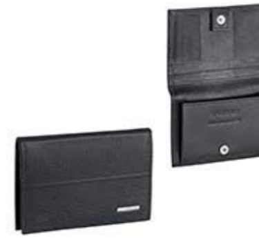
Name card holder 2 credit card slots document pocket name card pocket ◆ 157 349 10,5x7,5 cm