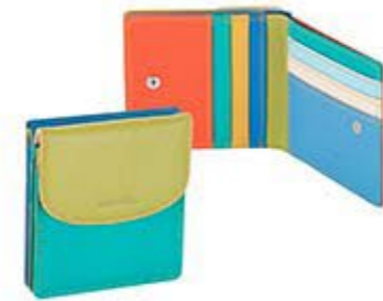
Ladies purse 6 credit card slots 4 document pockets coin pocket ◆ 123 420 10x10,5 cm