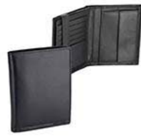
Wallet 10 credit card slots 6 document pockets 2 note compartments coin pocket ◆ 169 275 11x12,5 cm