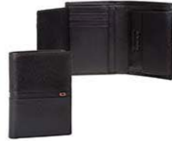
Wallet 7 CC slots 6 document pockets 2 note compartments coin pocket ◆ 158 266 9,5x12,5 cm