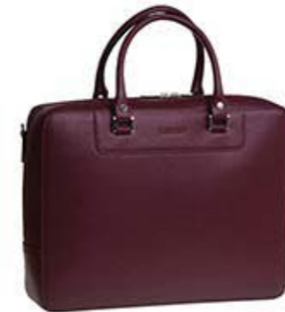
Briefcase 2 document pockets 9 credit card slots 3 note compartments zipper pocket coin pocket