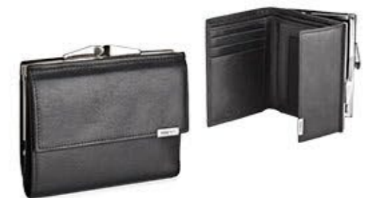
Ladies purse 6 credit card slots 2 document pockets 2 note compartments coin pocket