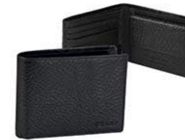
Wallet 7 credit card slots 4 document pockets 2 note compartments coin pocket ◆ 159 P20 12,5x9,5 cm