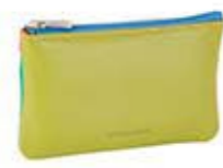
Key case zipper pocket 2 key rings ◆ 123 328 11,5x8 cm