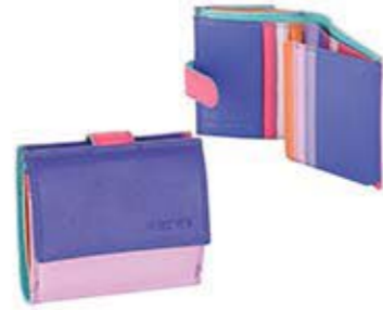
Ladies purse 9 credit card slots 3 document pockets 2 note compartments coin pocket ◆ 123 239 10,5x9 cm