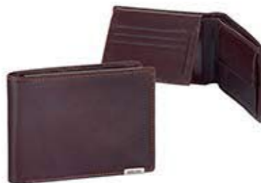
Wallet 8 credit card slots 4 document pockets coin pocket ◆ 161N 290 13x9,5 cm