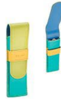
Pen case 2 pen loops ◆ 123 436 5x16,5 cm