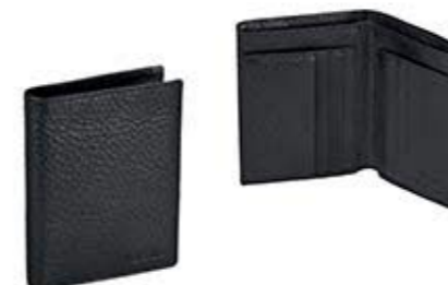
Document holder 6 credit card slots 4 document pockets note compartment ◆ 159 329 12,5x9,5 cm