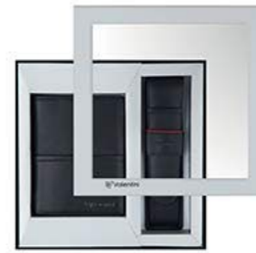
Gift set ◆ 154 101 Wallet 154-265 (12,5x9,5 cm) 8 credit card slots 7 document pockets 2 note compartments coin pocket Pen holder 154-435 (4x17,5 cm) 1 pen loop