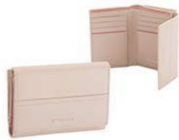
Ladies purse 8 credit card slots 4 document pockets 2 note compartments zipper pocket coin pocket ◆ 154 263 12x9 cm