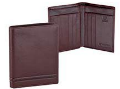
Document holder 4 document pockets 6 credit card slots 1 note compartment ◆ 152 329 9,5x12 cm