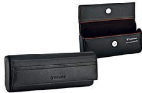
Spectacle case belt loop ◆ 154 287 16,5x7,5 cm