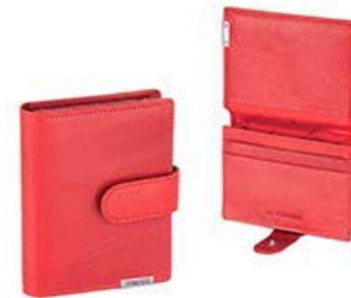
Business card holder name card pocket 2 document pockets ◆ 161N 013 10,5x7,5 cm