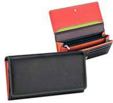
Ladies purse 18 credit card slots 5 document pockets 2 note compartments coin pocket ◆ 123 272 19,5x9,5 cm