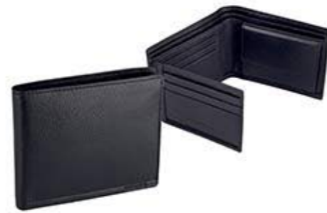
Wallet 6 credit card slots 2 document pockets note compartment coin pocket ◆ 169 137 12x10 cm