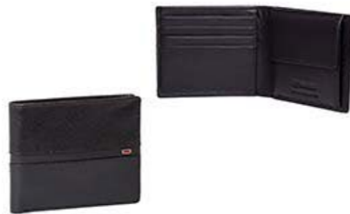
Wallet 8 CC slots 2 document pockets 2 note compartments coin pocket ◆ 158 901 11x9 cm