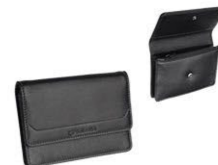
Sachet credit card slot document pocket zipper pocket belt assembling