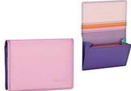
Name card holder 4 document pockets name card pocket ◆ 123 336 11x7,5 cm