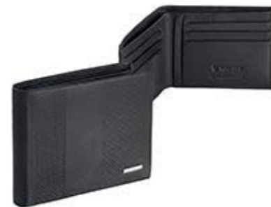
Wallet 6 credit card slots 4 document pockets 2 note compartments ◆ 157 335 12x9 cm