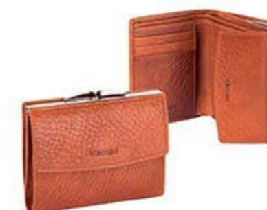
Ladies purse 3 credit card slots 2 document pockets 2 note compartments coin pocket