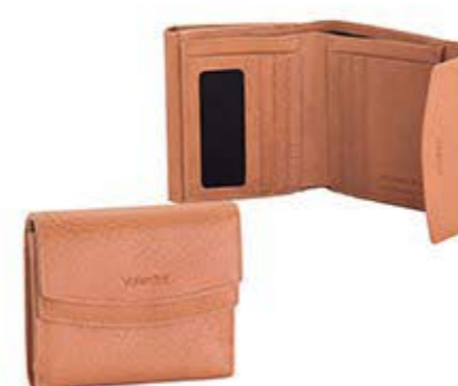
Ladies purse 6 credit card slots 6 document pockets 2 note compartments coin pocket