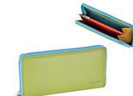
Ladies purse 12 credit card slots 5 document pockets coin pocket ◆ 123 864 19,5x10 cm