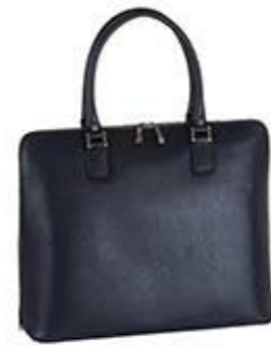
Briefcase 1 compartment 2 zipper pockets organizer adjustable strap max 135cm ◆ 557 104 39x29,5x10 cm