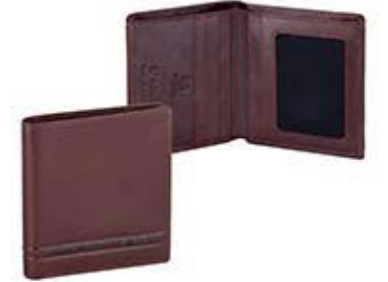
Wallet 6 credit card slots 2 note compartments coin pocket ◆ 152 415 9,5x10 cm