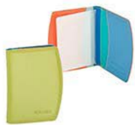
Credit card holder 4 document pockets 10 name card pockets ◆ 123 667 8x10,5 cm