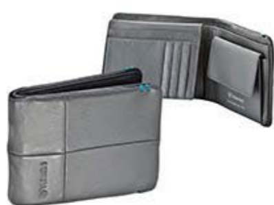
Wallet 8 credit card slots 7 document pockets 2 note compartments zipper pocket coin pocket ◆ 166 290 13x9,5 cm