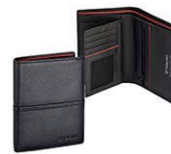
Wallet 8 credit card slots 7 document pockets 2 note compartments coin pocket ◆ 154 265 12,5x9,5 cm