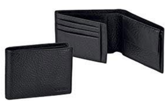
Wallet 6 credit card slots 5 document pockets 2 note compartments coin pocket ◆ 159 137 12,5x9 cm