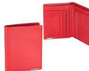
Document holder 6 credit card slots 4 document pockets note compartment ◆ 161N 329 12,5x9,5 cm