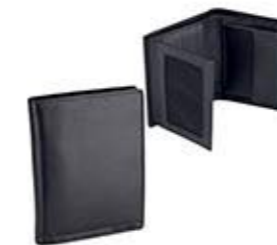
Wallet 4 credit card slots 4 document pockets coin pocket