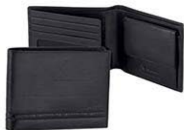
Wallet 4 document pockets 7 credit card slots 2 note compartments coin pocket ◆ 152 P20 12,5x9,5 cm