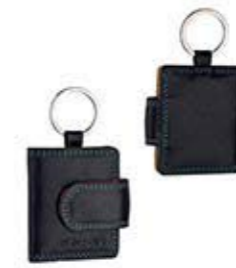
Key ring place for two photos ◆ 123 001 6x5 cm