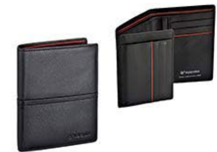
Wallet 9 credit card slots 6 name card pockets 2 note compartments ◆ 154 269 12,5x9,5 cm