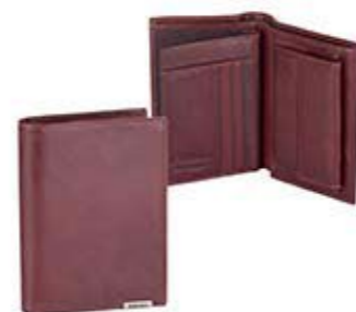
Wallet 4 credit card slots 4 document pockets 2 note compartments coin pocket ◆ 161N 469 13x9 cm